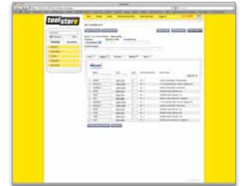
New simpler order block

Search help – The link to Search help can be found under the "Article" function on the top menu.