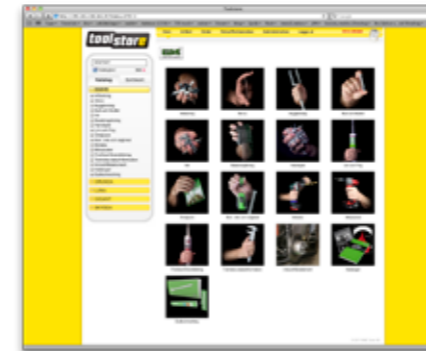
Comprehensive chapter images help you in to each brand's site, here exemplified through ESSVE.

Order – Place your orders in a special order block and send them in. When you place an order in Toolstore we can update your business system via an EDI file. We can also update your customer's business system.