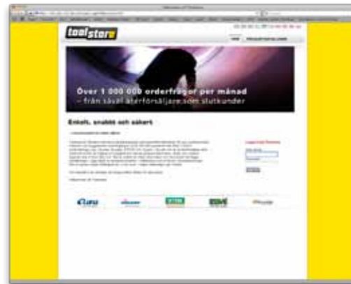
Login page www.toolstore.com

Reasons to join - and to use - Toolstore are both numerous and good. In addition to the large number of products, you always have access to complete and up-to-date product information and images. It is easy to find information and just as easy to place your orders. The possibilities for integration with your own system are good and it also provides access to customer-specific pricing information. Of course as end customers you can still be a part of the Toolstore world. The system is completely online and is open twenty-four hours a day throughout the year. The "Efficient handling" that rational management that Toolstore offers means there is a great deal of time and money to save. The only things needed to get started are an internet connected PC, personal user identities and passwords.